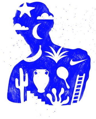
Artefacto No. 4. Courtesy of the artist

Yes, our ancestors were overcome by disease, our lands were conquered, but I'm interested in healing. I'm not interested in promoting this idea that I am mad; that doesn't help our people.